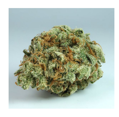
Blue Dream Sativa-dominant Hybrid

Balances cerebral stimulation with full-body relaxation. Boasting 18% THC and low CBD, it's a top pick for both newbies and seasoned cannabis enthusiasts.