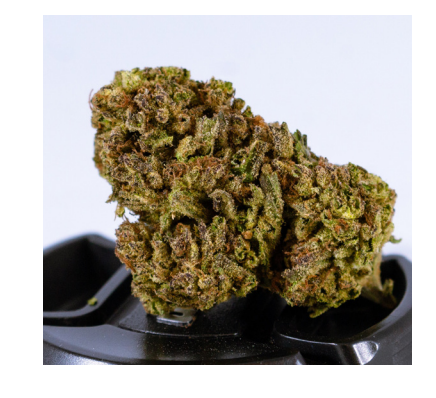
White Widow Hybrid (60% Sativa, 40% Indica)

Blends tropical flavors of Mango Haze with notable levels of cannabidiol, offering an aromatic and soothing experience.