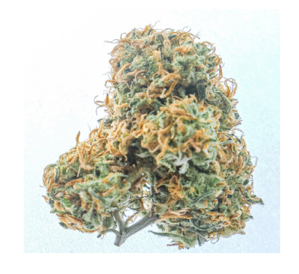
Mango Haze High-CBD Hybrid

Balances cerebral stimulation with full-body relaxation. Boasting 18% THC and low CBD, it's a top pick for both newbies and seasoned cannabis enthusiasts.